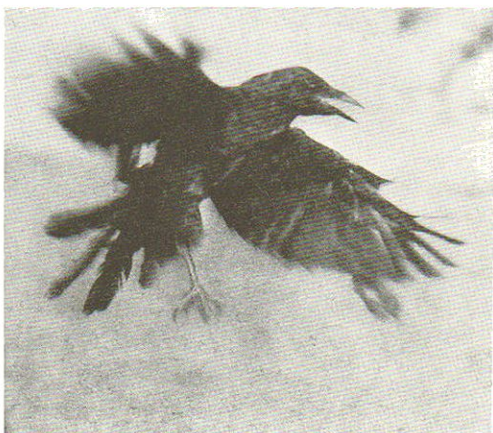
Judas doing his stuff